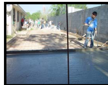
Line it up, bring 'em out Benbrook + Big Heart