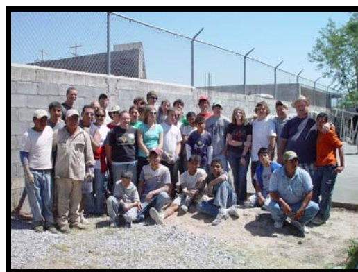
Gracias— Corazon Grande, Sunnyview and Benbrook

We continue to believe that EDUCATION is a vital key.