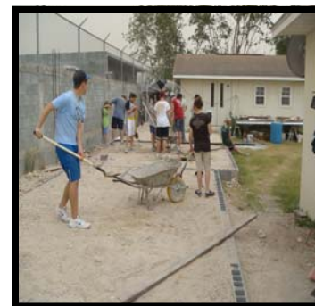
Sunnyview Baptist group spread caliche for our memorial all-purpose building

around the foundation for the cement pad. Wednesday a group of young people came in from First Baptist Church in Benbrook, TX and mixed the cement and poured the floor for our building. The young people from Benbrook and the guys from Big Heart Children's Home shoveled sand and gravel and wheeled four wheelbarrows full of cement for close to 5 hours-46 bags of cement. A cement truck came by with 1/2 meter of ready-mix trying to sell it so we bought that to help out.