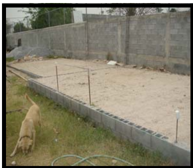
Ready to add wood forms and metal armex