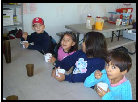
Chit-Chat around the table with an eye on the camera.