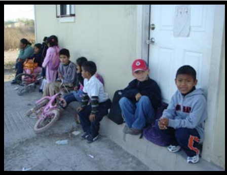
Little Flock "kids" wait for their teacher to arrive.