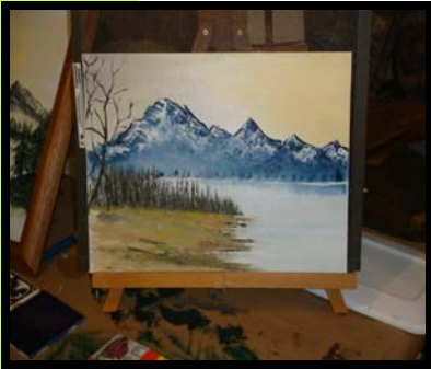
Another one of Jorge's masterpieces in oil